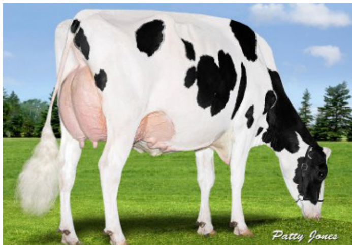
G Dam: Walnutlawn McCutchen Summer