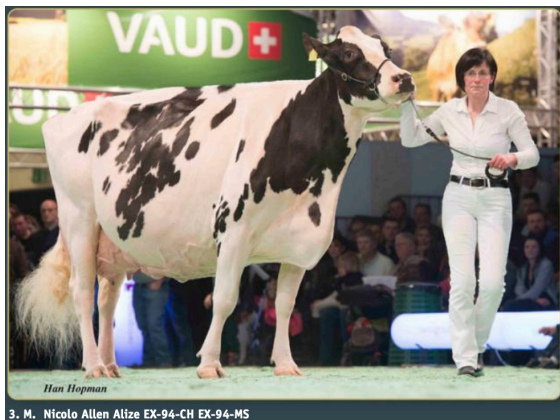
3. M. Nicolo Allen Alize EX-94-CH EX-94-MS

3rd Dam is the 6th Generation EXCELLENT with at least 60,000kgs lifetime production 4th Dam was 1st @ National Show & SPACE, France 2014