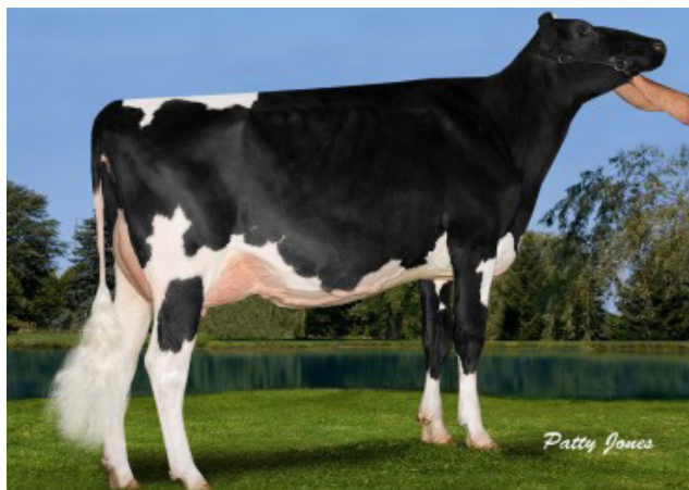
3rd Dam: Misty Springs Lavanguard Sue