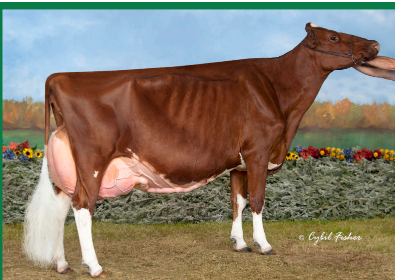
5th Dam: KHW Regiment Apple-Red (EX96-3E-USA)

Res.Champion R&W World Dairy Expo 2013; HI Red Impact Cow of The Year 2013.