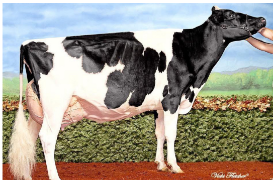
3rd Dam: Kingsway Sanchez Arangatang EX95

Nelcam Tab Astra EX 90 CAN4674606 by A Kingstead Valiant Tab EX (KVT)