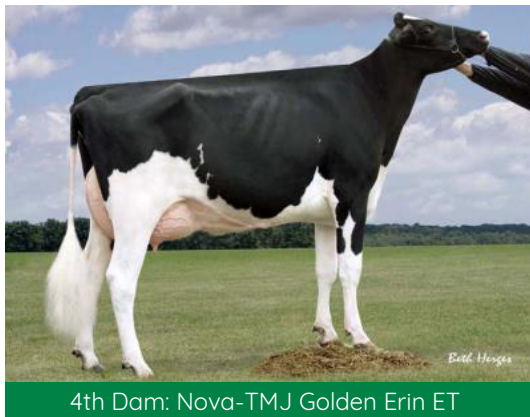
4th Dam: Nova-TMJ Golden Erin ET

3 Dam Leagh Sebastian Erin ET is the highest classified member of the DUBS-EROY Cow Family in the world. She is Maternal Sister to Ryan-Crest Sanz Extact - 3 Times Nominated Jnr All-American.