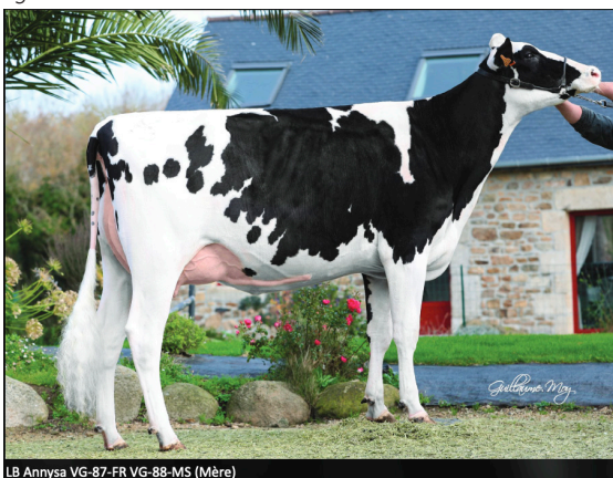
LB Annysa VG-87-FR VG-88-MS (Mère)

- Great pedigree: Amaretto Red x Impression VG-87 x Goldchip VG-88 x Champion EX-95 x Durham EX-90 x Skychief EX-97 x Starbuck EX-94