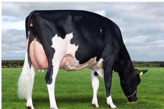
G Dam: Ortongrange Doorman Arangatang

Nelcam Tab Astra EX 90 CAN4674606 by A Kingstead Valiant Tab EX (KVT)