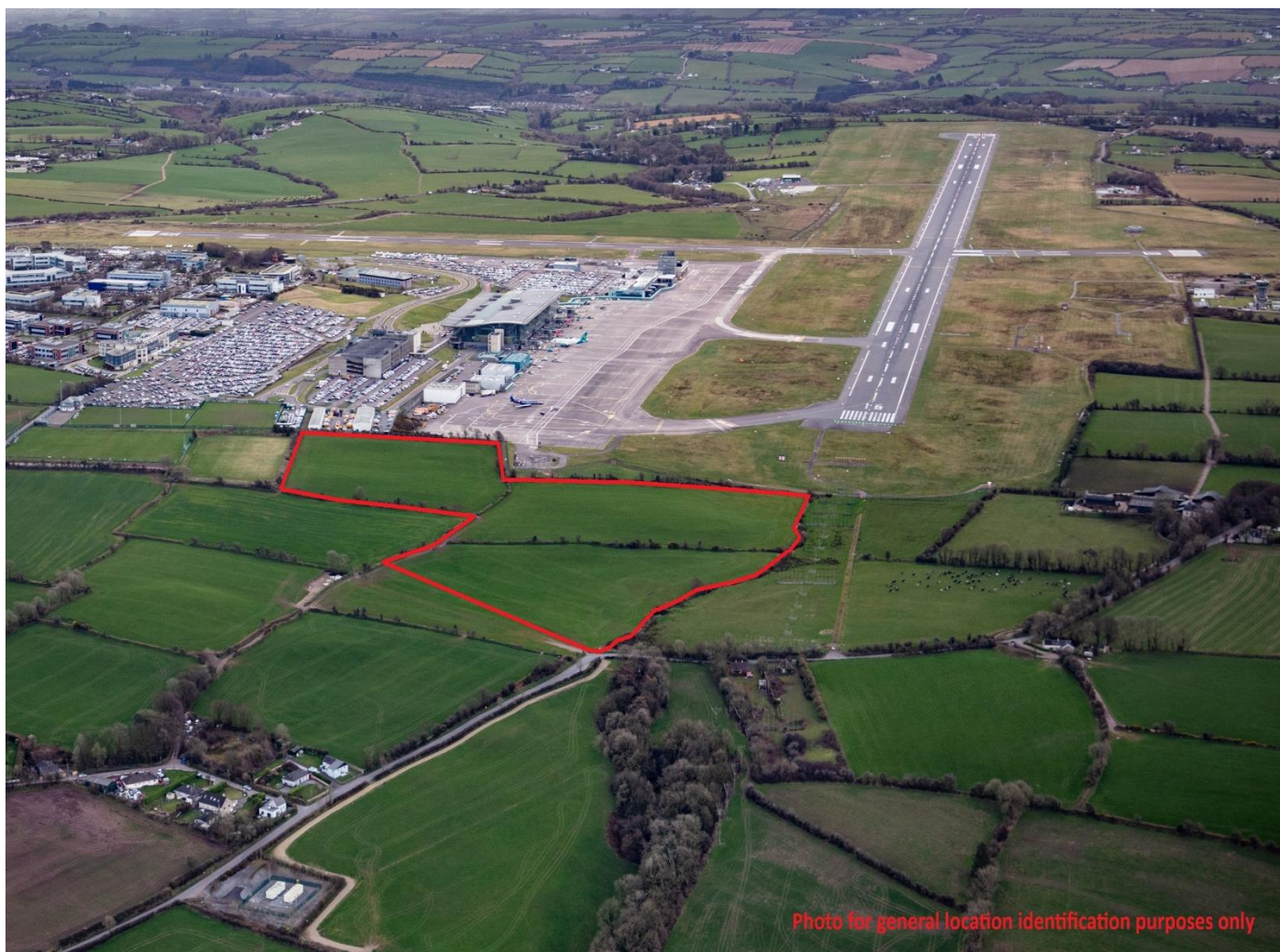
Photo for general location identification purposes only

Development Site c. 23.08 acres / c.9.34 hectares Lehenaghmore, Co Cork